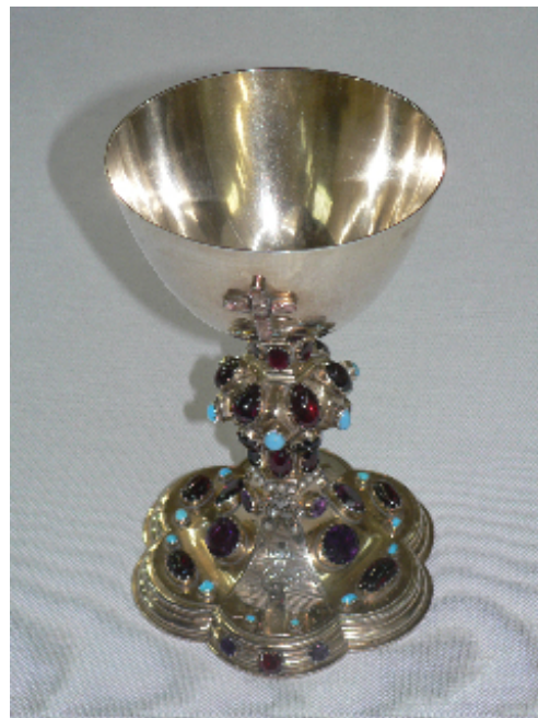
THE KING CHALICE

http://hansard.millbanksystems.com/common/1860/jan/30/question-5 .