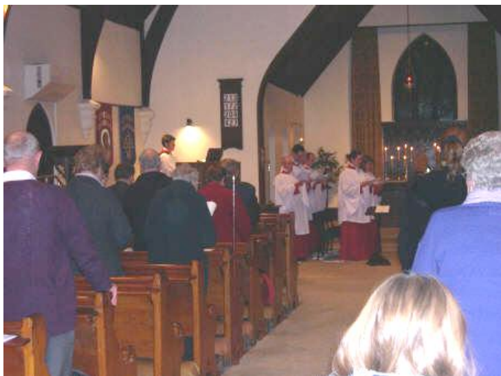
of the choir and congregation at the Evensong